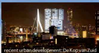
recent urban development: De Kop van Zuid